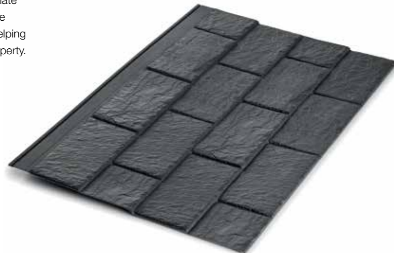
Tile sheet **

* 5° pitch available using SlateSkin only, 10° pitch available using alternative tiles. ** Maximum SlateSkin single facet size is 6 metres.