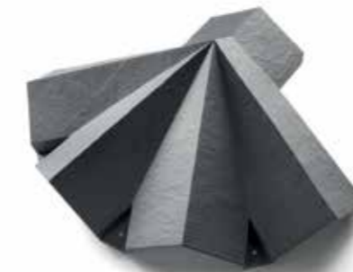
5-way ridge top cap ERS 1326GY2 (25°) Also available in: 15° (ERS 1330GY2) 20° (ERS 1331GY2) 30° (ERS 1332GY2) 35° (ERS 1333GY2)