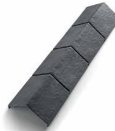
Ridge/hip length cap (6m) ERS 1321GY2-FG