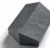
Victorian hip end cap ERS 1329GY2-FG