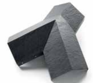
3-way ridge top cap ERS 1322GY2 (25°) Also available in: 15° (ERS 1334GY2) 20° (ERS 1335GY2) 30° (ERS 1336GY2) 35° (ERS 1337GY2)