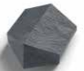
Edwardian hip end cap ERS 1325GY2-FG