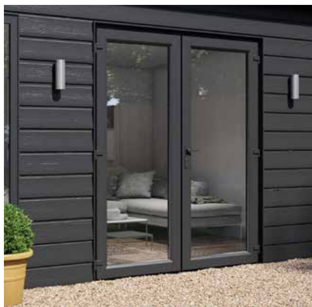
French Door (Straight edge)