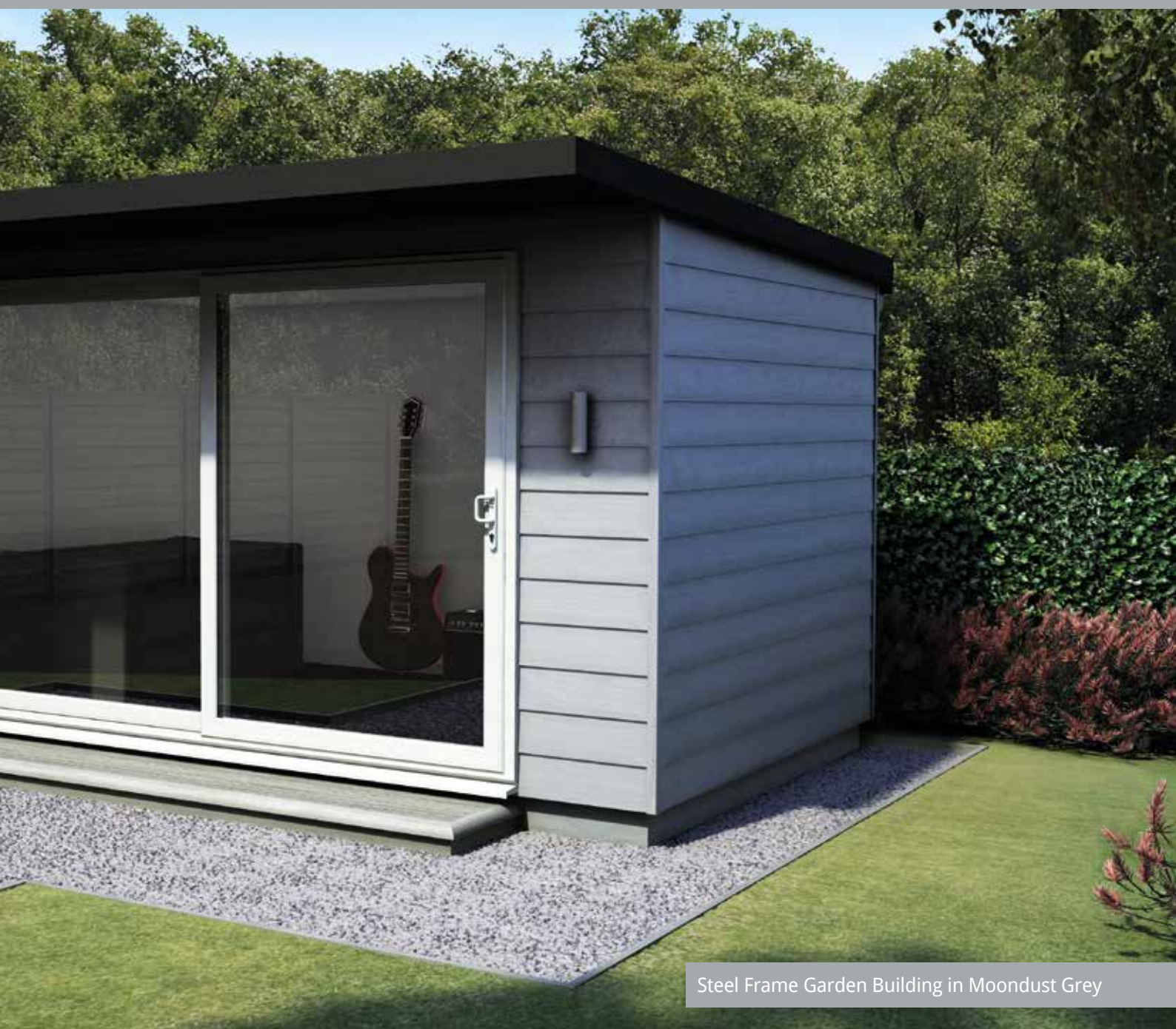
Steel Frame Garden Building in Moondust Grey