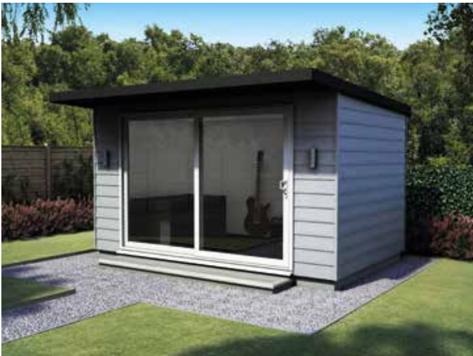
Patio Door with cladding in Moondust Grey

All our Kyube Buildings come with 100mm cavity wall insulation and an insulated steel roof. Added to the interior finishes, this gives you a garden building solution which is ready to go from day one.