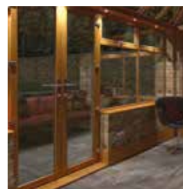
Deeplas Window Boards