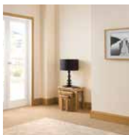
Roomline PVC-U Skirting