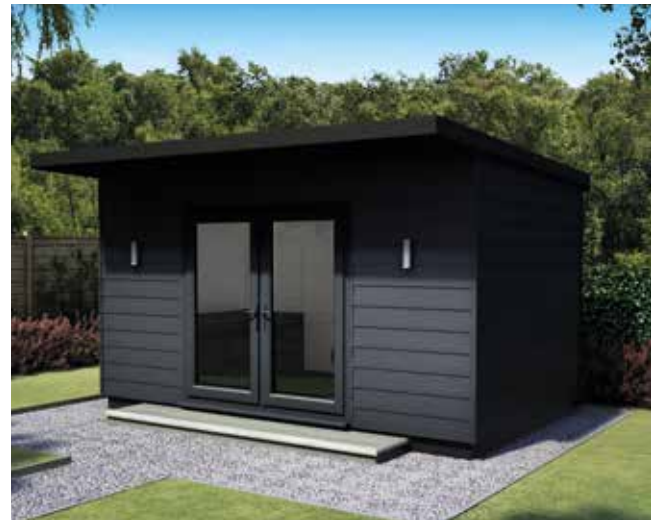
French Door with cladding in Anthracite Grey