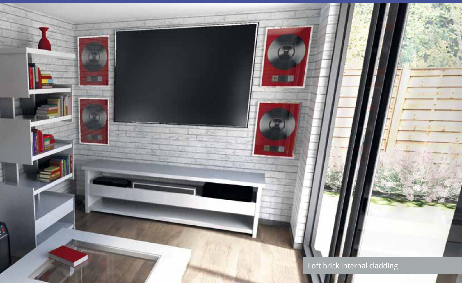
Loft brick internal cladding