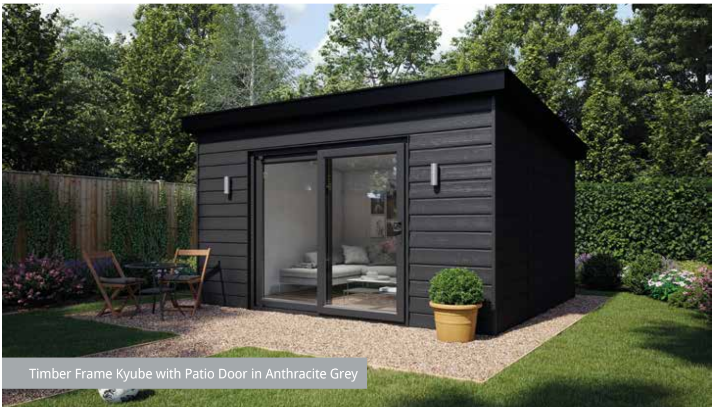
Timber Frame Kyube with Patio Door in Anthracite Grey

All our Kyube Timber Rooms come with a 10-year guarantee, so you get peace of mind as well as flexibility.