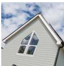
Coastline Lightweight Composite Cladding