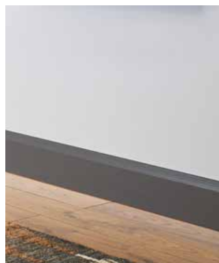
Recycled PVC-U skirting