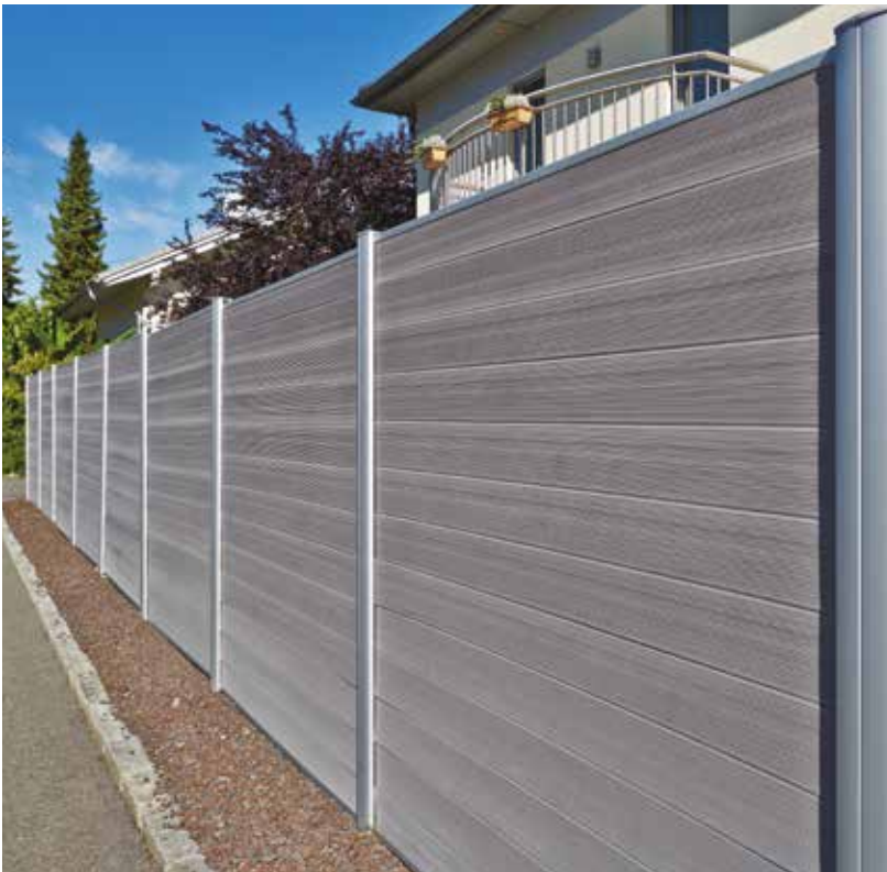
Twinson Premium Fencing Kits - innovative fencing system