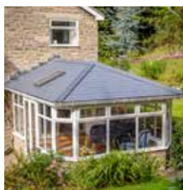
Equinox Tiled Roof System