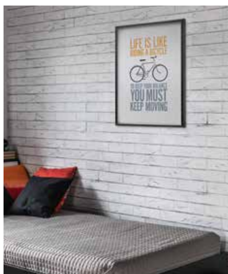
Internal cladding options