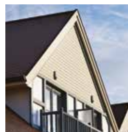
Deeplas Embossed Cladding