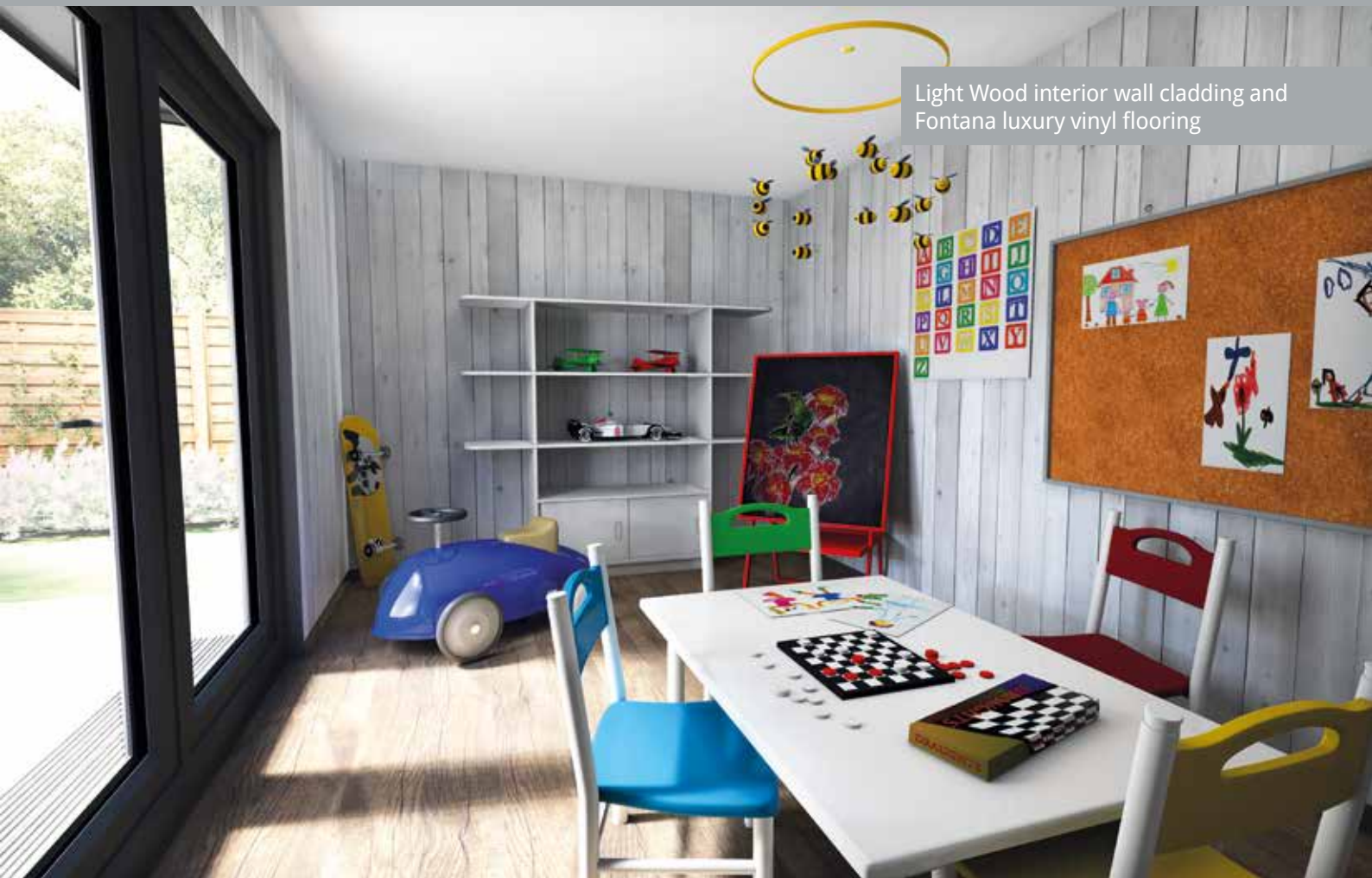
Light Wood interior wall cladding and Fontana luxury vinyl flooring