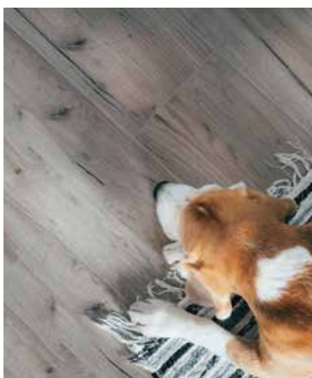
Luxury vinyl tile flooring