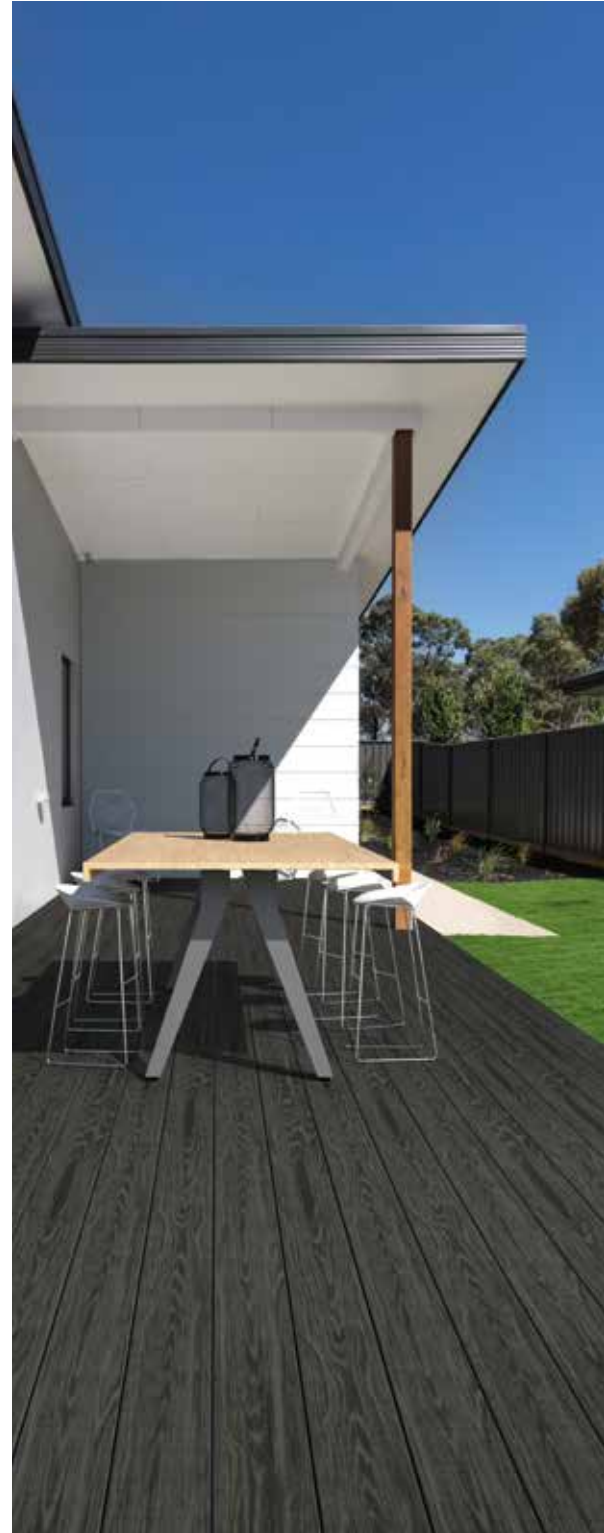
Composite Decking - the durable alternative to timber