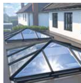
Skypod Lantern Roofs