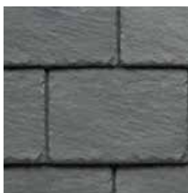
Slateskin GRP Sheet Tile System