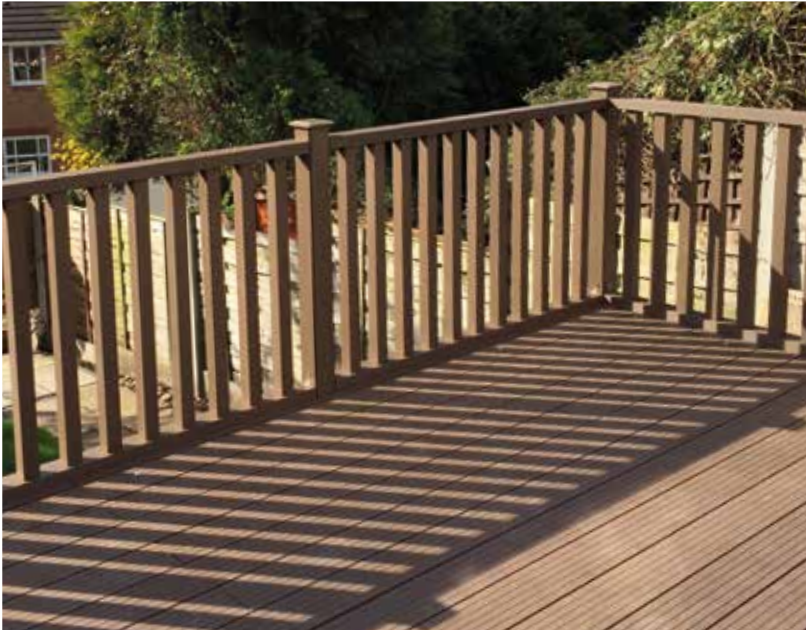
Balustrades - finish your decking project in style