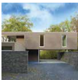
Twinson Premium Cladding