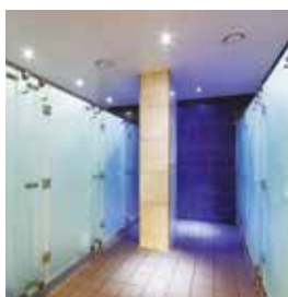
Internal Wall and Ceiling Panels