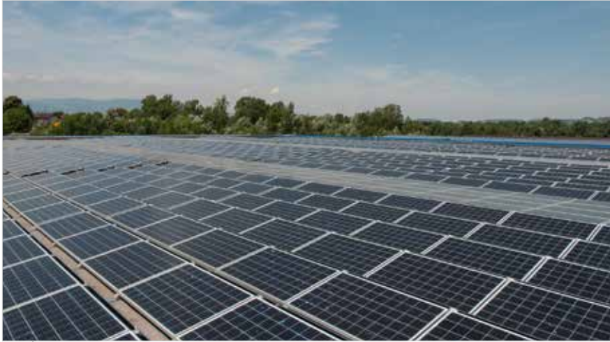
Slovenia Installation: 150 kW | S-Dome System