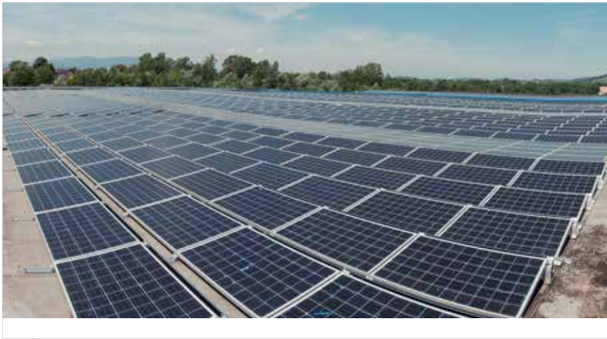
Slovenia Installation: 150 kW | S-Dome System