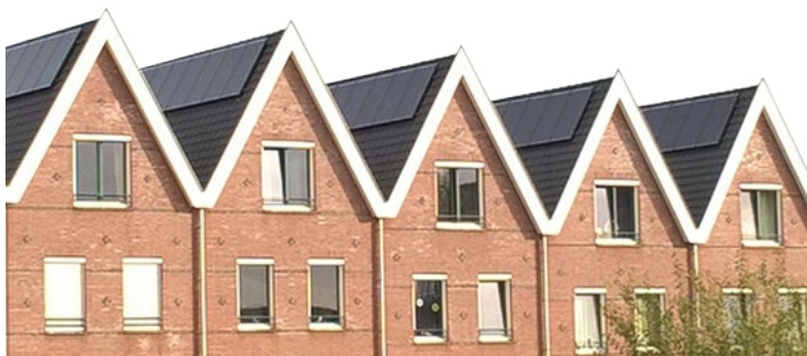
Speedy calculation, speedy order picking and speedy mounting