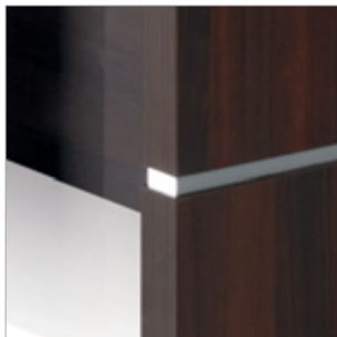
Brushed aluminium decorative bands