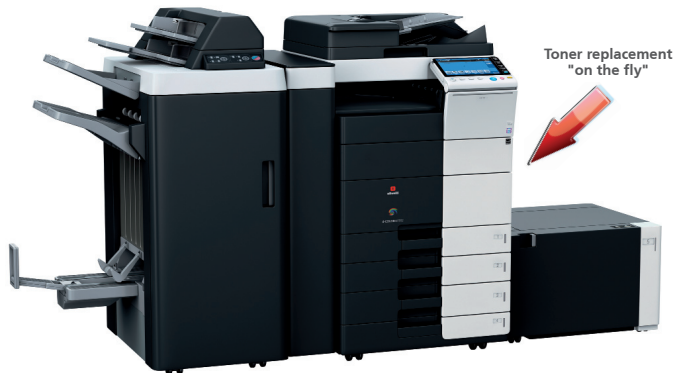
d-Color MF452 - MF552