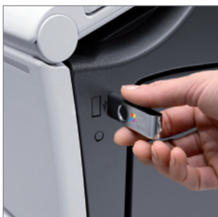
Direct printing and scanning via USB for direct management of Microsoft Office formats

The following Scan-to functions are available: Email (Me); SMB (folder on your PC); FTP (server); Box (archive folder) and direct to USB Memory Stick. You can save in the following file formats: JPEG; TIFF; PDF; Compact PDF; Encrypted PDF; PPTX (PowerPoint); XPS and Compact XPS.