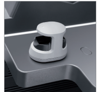
Advanced security options and authentication systems