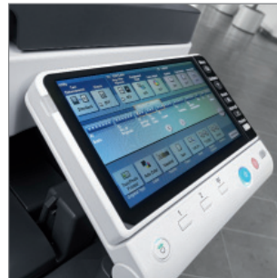
Capacitive 9.0" control panel

Using the advanced functionality of the new range is easy. The innovative 9-inch Capacitive Colour Multi-touch Display adopts "Flick and Drag" technology, similar to the operation on today's smartphones and Tablet PCs. The menu screen provides direct access to Scan, Fax (option), Box (archive) and Copy. When selecting additional functions, they appear in pop-up windows, thereby keeping the main panel both visible and available. This eliminates lots of sub-menus, so the user doesn't get lost when selecting additional functions. In effect, this panel becomes the access point for the functions of the machine guiding the user in the generation / sharing / archiving of the company's document flow . The menu can be customised to make processes more automatic; short cuts to functions can be created using a selected key or actions can be condensed into a single keystroke by saving macros.