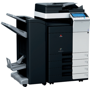
d-Color MF222- MF282 - MF362

** Required for the d-Color MF452/d-Color MF552 when no finisher is attached